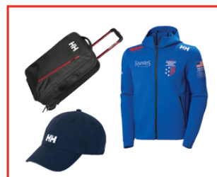
HH Swag Bag 3: AM Jacket - Cobalt (XL); Sport Expedition Carry-On; crew cap;