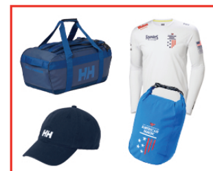
HH Swag Bag 4: AM UPF Tech Jacket - White (L); Scout Duffel - Blue; AM Dry Bag - Blue (3L); crew cap;