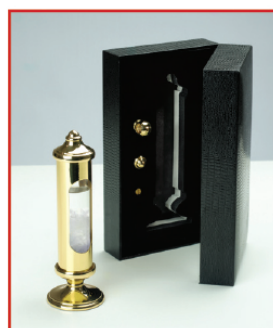
#200 Weems & Plath Stormglass (Brass)