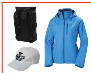
HH Swag Bag 1: crew hooded jacket - Blue (L); AM crew cap; back pack