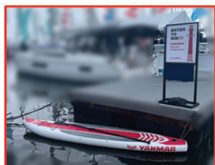
Yanmar: Inflatable standup paddleboard