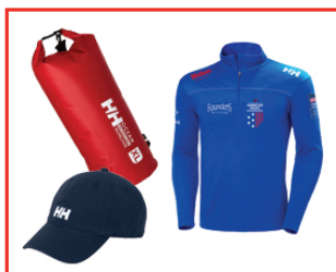
HH Swag Bag 2: dry bag - Red (XL); AM Half Zip Pullover - Cobalt (L); crew cap