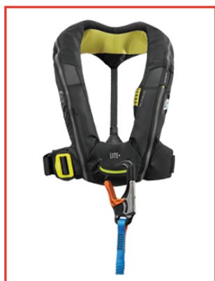
Spinlock Deckvest Lite: plus with harness (two)